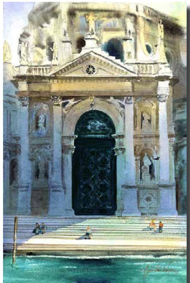
Della Salute III