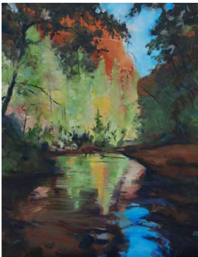
Reflections by Linda Pullinsi

You can find the registration opportunity for all workshops on the AWA website under Member Workshops. You will be able to complete the registration conveniently online with your credit card.