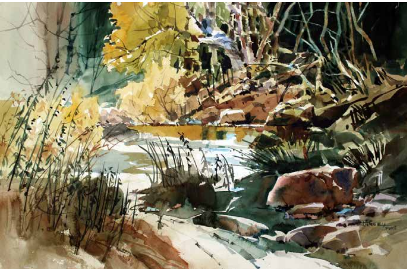
Virgin River Bend