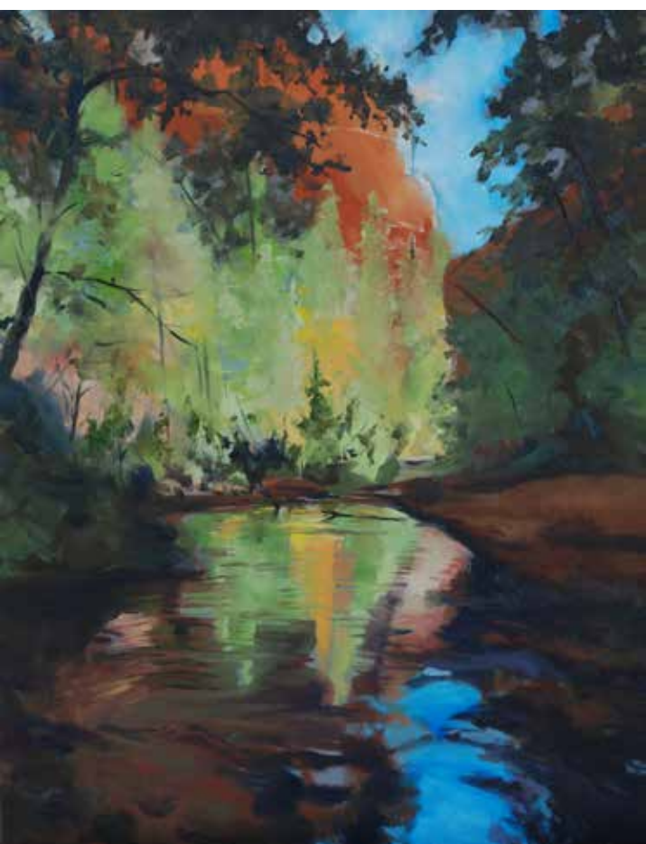
Reflections by Linda Pullinsi

You can find the registration opportunity for all workshops on the AWA website under Member Workshops. You will be able to complete the registration conveniently online with your credit card.