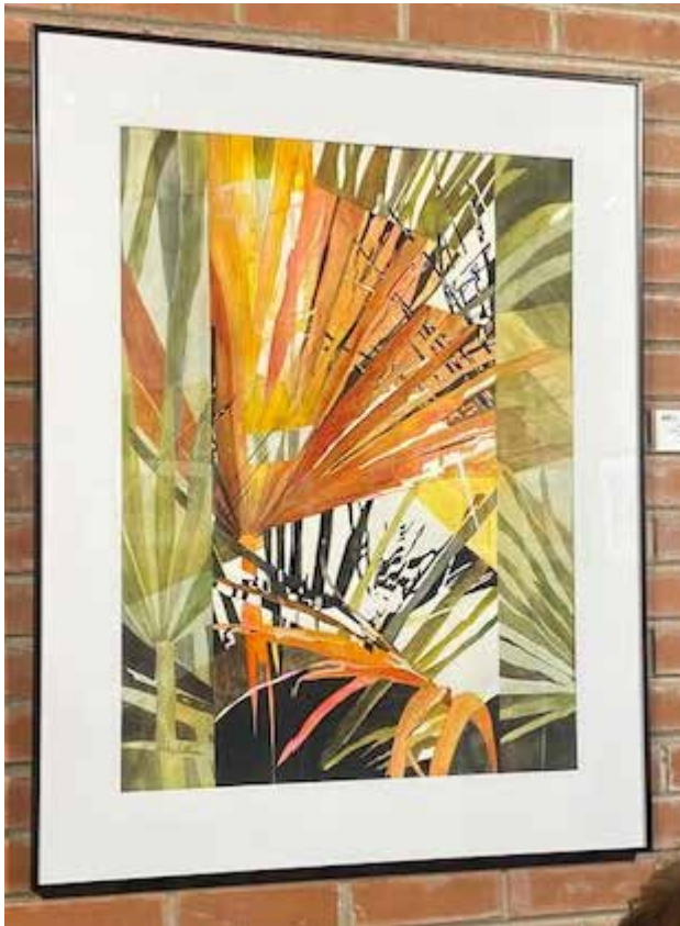
Best of Show: Humilis Harmony #5 By Deb Sullivan