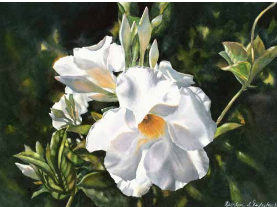
(Left) Mandevilla Kathleen Giles