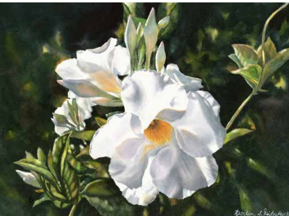
(Left) Mandevilla Kathleen Giles