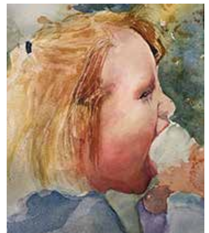
Finished art: Kooper's Birthday Bliss