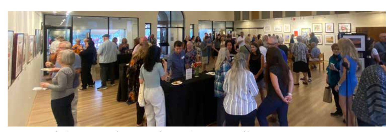
The reception had an exceptional turnout and quite a few paintings sold!