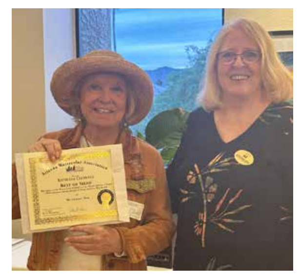
The Coconut Man