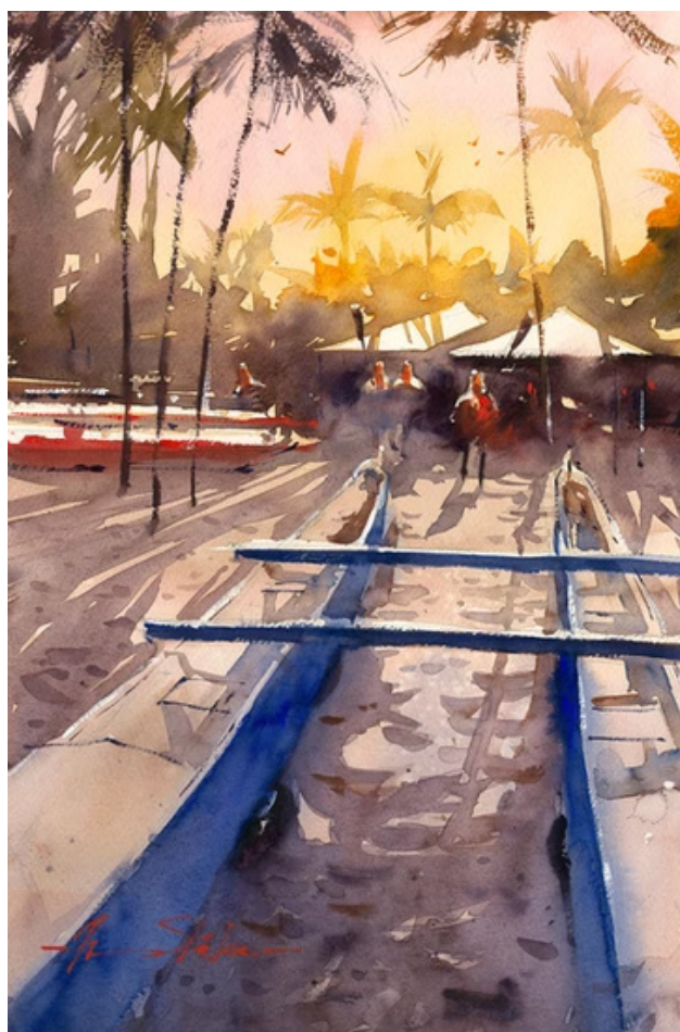
King Kam Boat Rentals