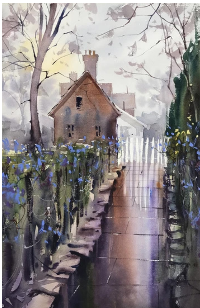
The English Garden

https://azwatercolor.com/juror-workshop/