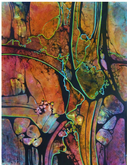
HILLSIDE STRATA BY DYANNE LOCATI