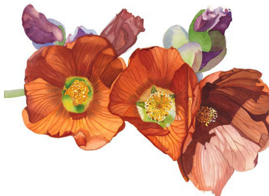
SHERRY KIMMEL - FRAGILE BEAUTY