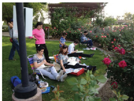
2013 Paint the Garden

MCC Rose Garden Located on the north side of campus, Southern & Dobson, entrance south of Southern Ave. 1833 W. Southern Ave., Mesa, AZ 85202 480-461-7022