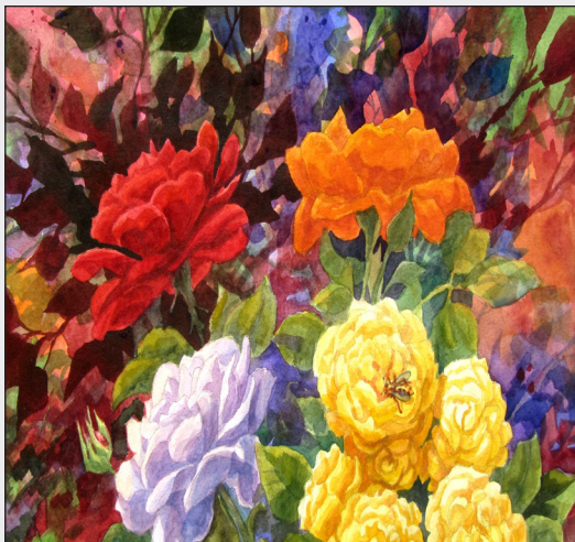
"Mesa Rose Garden," painted at the 2014 MCC event